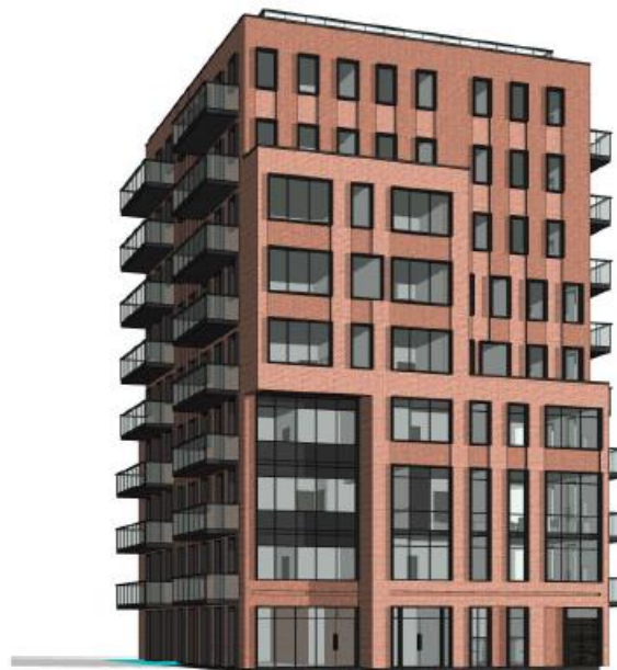
② 3D View 1