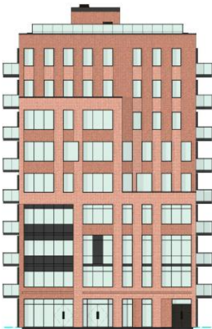
① North 1 : 200